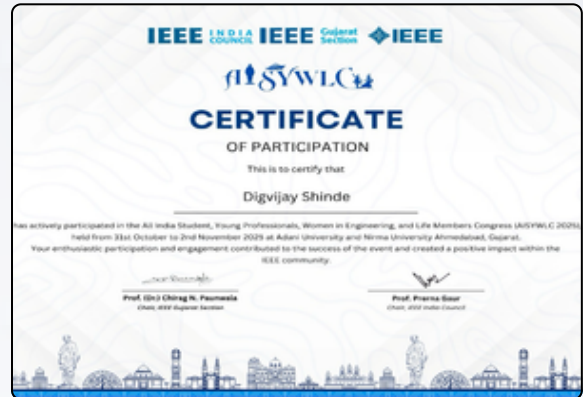
DIGVIJAY SHINDE (2U1)